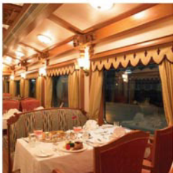
Luxury aboard The Golden Chariot